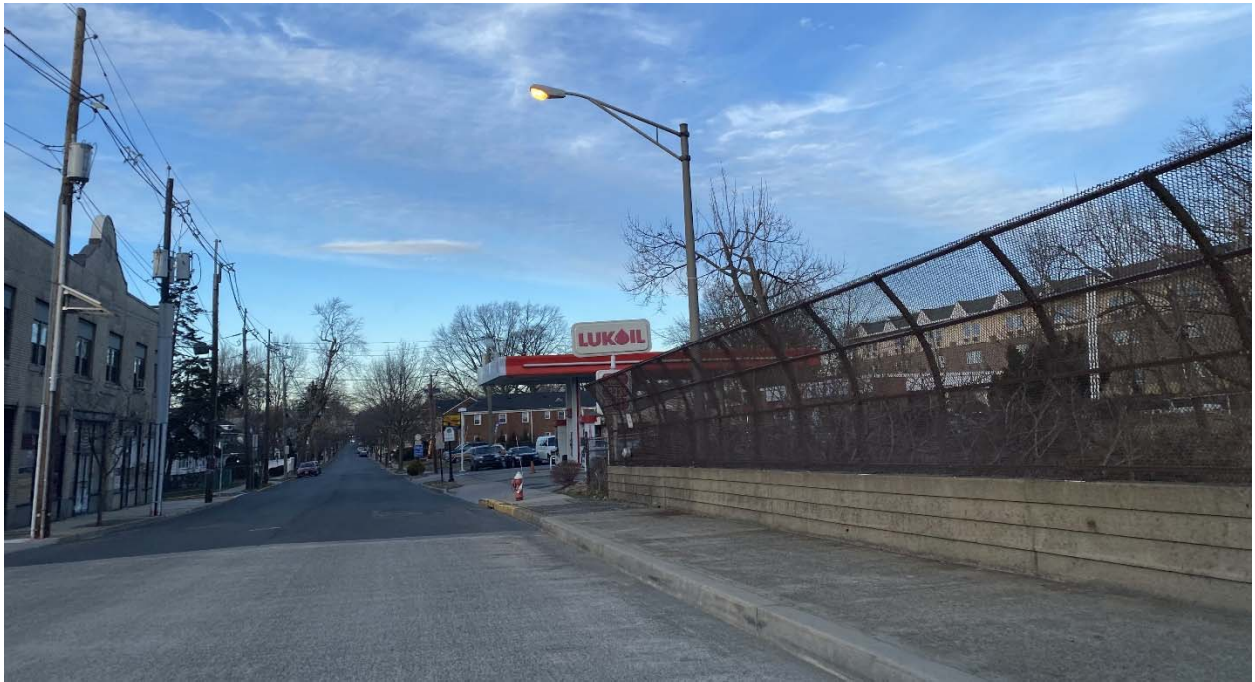
Looking north on Queen Anne Road from south of subject property