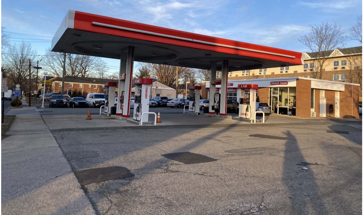
Existing use on subject property viewed from southwest corner of site