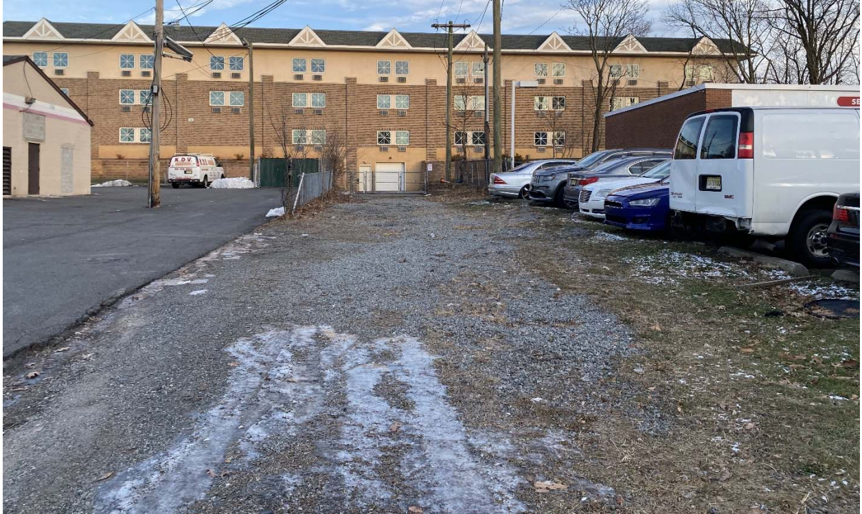
Existing gravel driveway on access easement at north end of subject property