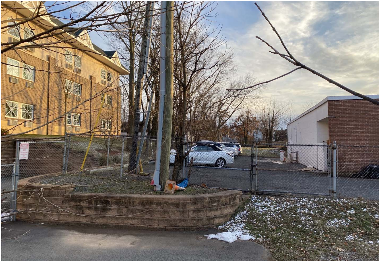
View along the eastern property line of the subject property