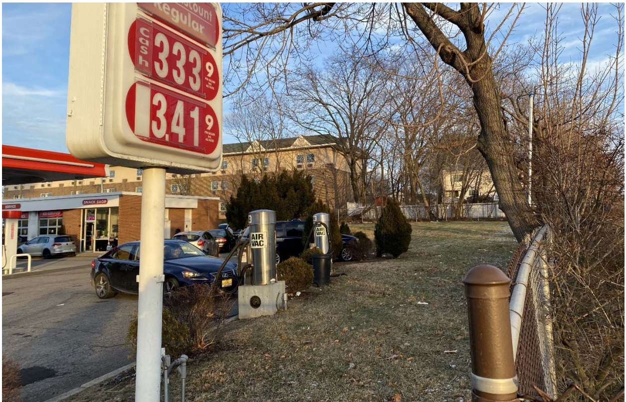
View along the southern property line of the subject property