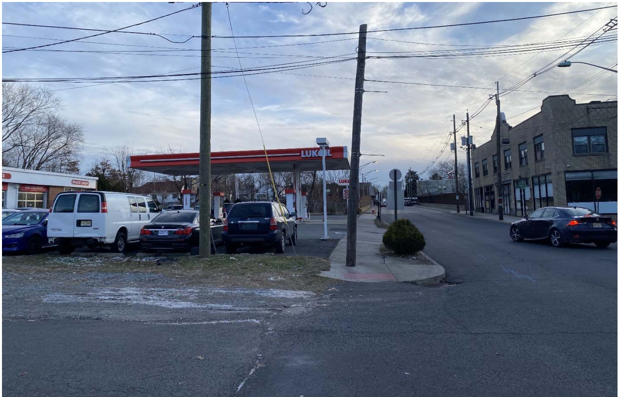
Looking south on Queen Anne Road from north of subject property